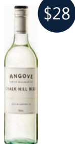
Chalk Hill Semillon Sauvignon Blanc