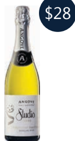
Studio Series Sparkling