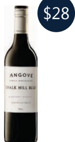
Chalk Hill Cabernet Merlot